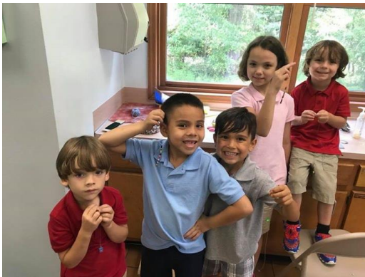
Lower graders made alternative backbones. Some were made of beads, some of sequins, and some of plastic craft supplies!