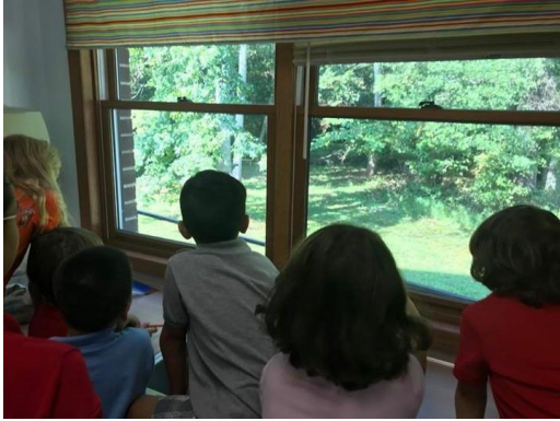
We got to see some wild turkeys this week!