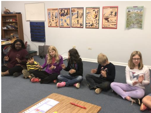
Sing songs during worship time!