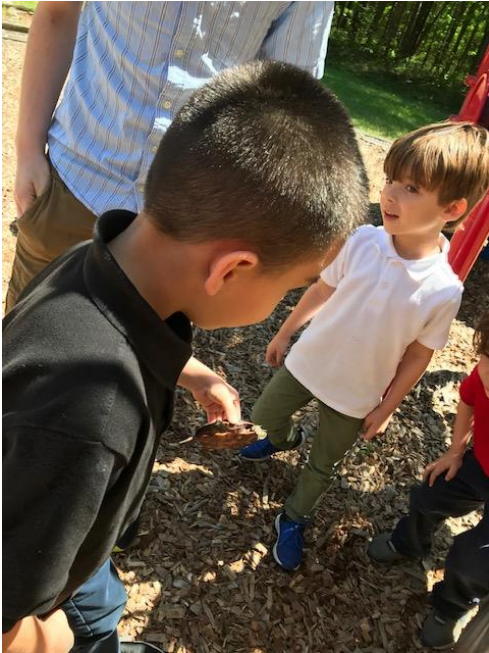
We found a turtle at recess!