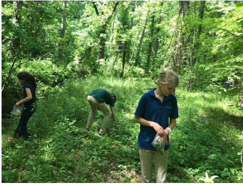
Searching for nature items for our nature collages.