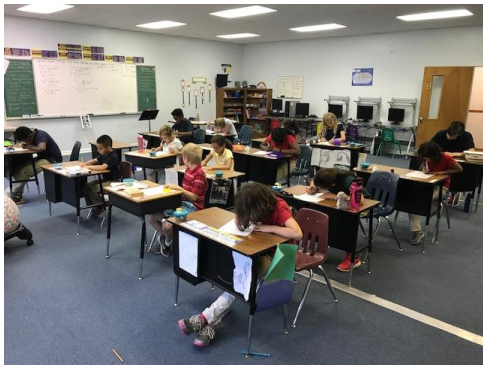
Working hard on our final class assignments.