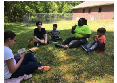
Every beautiful day is a picnic day for SAS!

Do you ever stop to consider what it will be like to be in heaven? Our time spent here on earth is such a pale comparison to how glorious it will be! It gives my heart joy to know that all sadness, pain, grudges, unresolved frustration, conflict, anger, and sinful thoughts will be destroyed! My prayer is that we can use our time on earth to grow in godliness and love for one another! At school this means dying to self each day. What does that look like? For us it means discussing the stressors on our hearts, brainstorming for ways to have peace during our life 'storms,' and beating each other's burdens. What does it look like in your home?