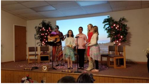
The students sang their favorite love songs to God for our Valentine's Banquet.