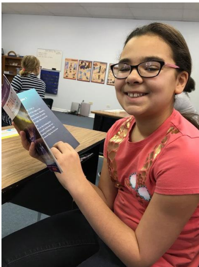
India enjoying one of our donated books.