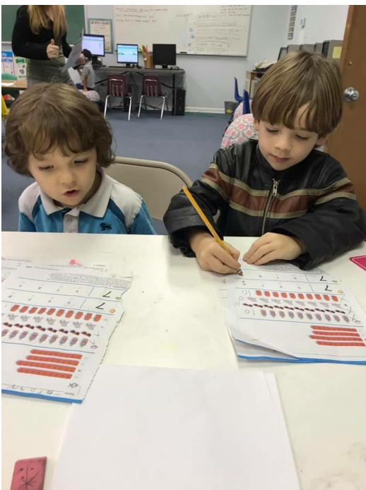
Kindergarten focused on math instruction.